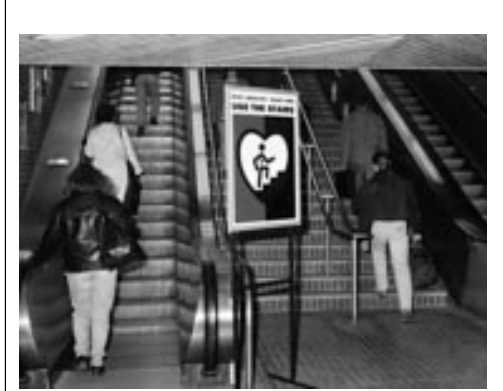
Figure 1 Motivational poster placed between stairs and

The study results led to the design and distribution of stair walking promotional posters throughout Scottish workplaces by the Health Education Board for Scotland. Within Glasgow a new promotional campaign was developed using life size cut out cartoon characters placed at the foot of escalators, as posters on platforms, and as advertising cards on trains (fig 2). These materials encouraged stair use and had straplines explaining the health benefits of small amounts of physical