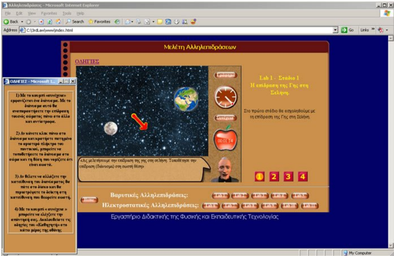
Figure 1. Main screen of the application.