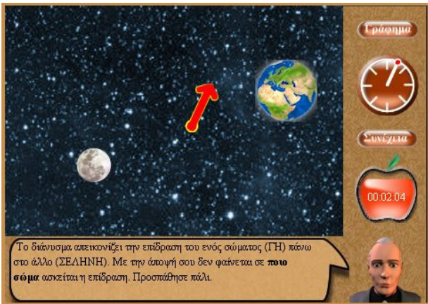
Figure 2. Typical 'Lab' stage: the case of the Earth and the Moon.