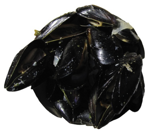
Figure 14.1 A bowl of steamed mussels, Mytilus edulis . Edible bivalves, especially cooked wild bivalves such as mussels, oysters and clams, are some of the most nutritious foods for humans on the planet.

severe mental decline, not from the human genome project, but from nutrition and health management. The view of diet being a major driver of health and disease dates back to Sir Robert McCarrison's studies in India, early last century. Eating adequate amounts of foods rich in bioavailable brain nutrients, for example, shellfish<sup>1</sup>, such as mussels (Figure 14.1) and oysters (which contain nutrients including protein, docosahexaenoic acid (DHA), arachidonic acid (AA), iodine, iron, copper, zinc, manganese, and selenium as well as a variety of antioxidants including vitamins; see Table 14.1) promotes health and helps prevent diet-induced mental ill health today (e.g., Robson, 2009). This overview highlights the major changes that are urgently needed in order to promote health and help prevent the epidemic of mental ill health (for an overview of preventing non-communicable diseases, see Robson, 2013b). After all, disease prevention, in the long run, is far less costly than treatment.