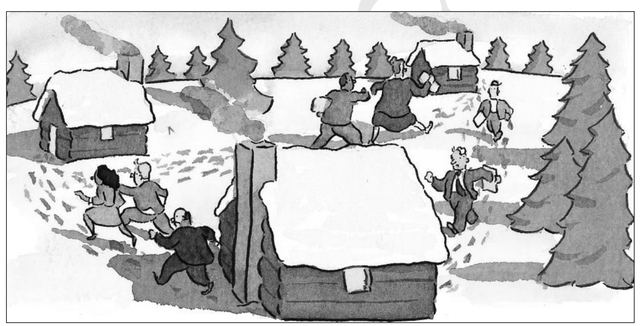
Call an informal retreat "planning," let conventional planners organize it, and watch how quickly the event becomes formalized.

Such strategies often cannot be developed on schedule and immaculately conceived. They must be free to appear at any time and at any place in the organization, typically through messy processes of informal learning that must necessarily be carried out by people at various levels who are deeply involved with the specific issues at hand.