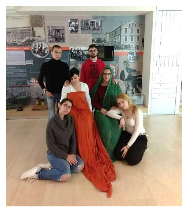
Figure 5. Snapshot (Freeze frame) from the Inquiry Drama Project in the Historical Museum of Alexandroupolis (Simos Papadopoulos)