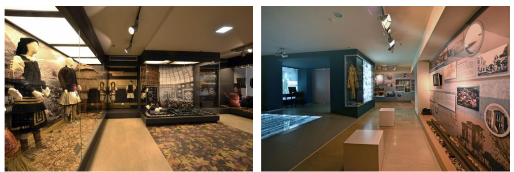
Figures 2 & 3. Permanent exhibition of the Historical Museum of Alexandroupolis

The Historical Museum of Alexandroupolis is a local museum with a modern museological approach with two permanent exhibitions about local history and heritage (Figures 2 and 3). It was built in 1995 in the center of the city. For the creation of the Historical Museum of Alexandroupolis, the city's residents offered personal and family objects, artifacts, original photographs, and documents. A remarkable collection of paintings by local artists and a collection of significant books and essays about local history can be found in the museum library. There is also a conference hall, available for associations and organizations, as the Historical Museum of Alexandroupolis, The museum is open to society and collaborates with other museums so many periodic exhibitions take place. It implements pedagogical programs of a variety of themes for all school grades (Figure 4), and it collaborates with the pedagogical community and the local community.