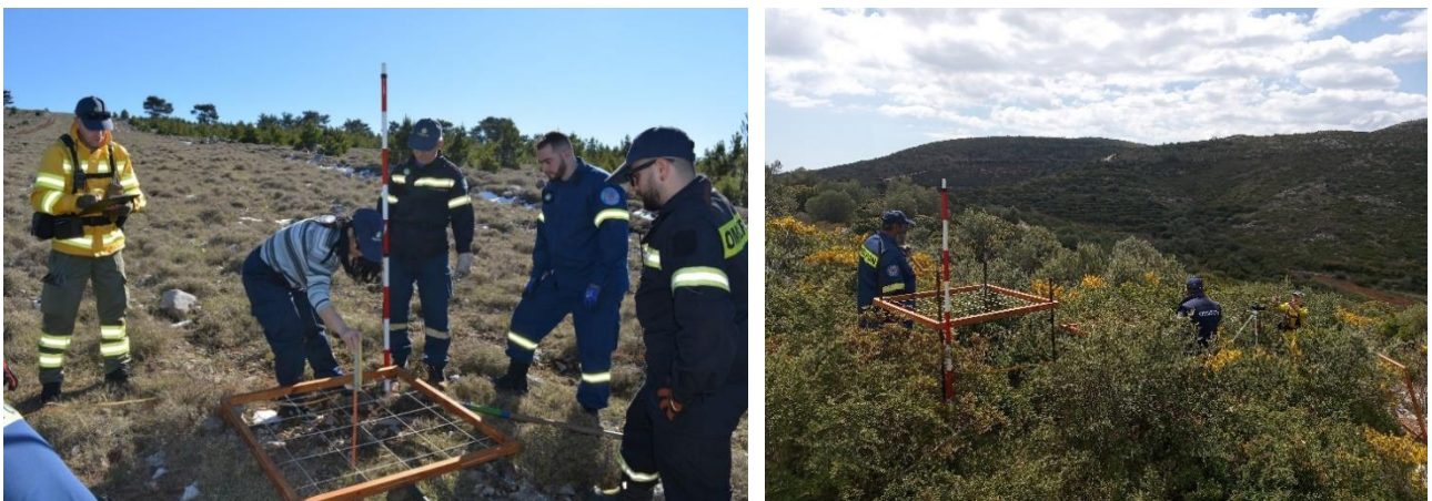
Figure 3 - Training Omikron volunteers in destructive sampling of surface fuels