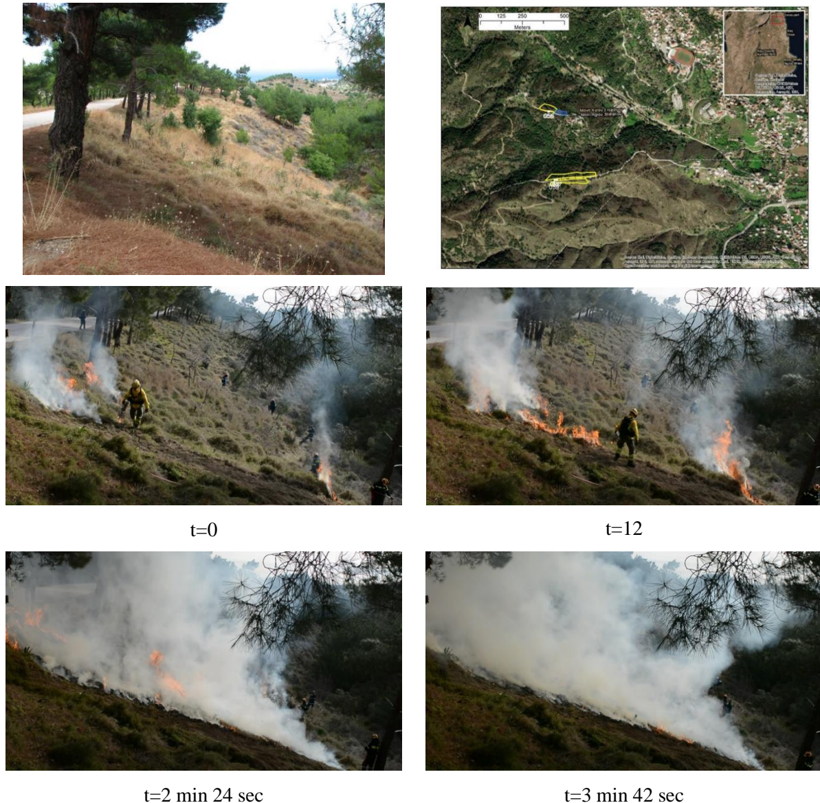
Figure 4 - PB application in one of the plots, in February 2022. The upper left photo is taken in July 2021