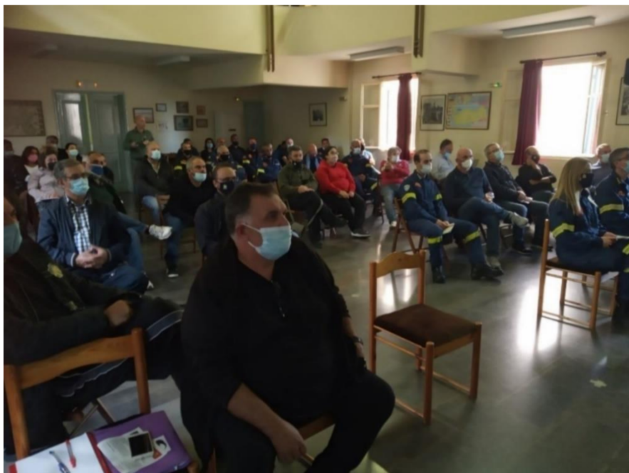
Figure 6 - The stakeholders showed interest in the kick off meeting of the project, in Chios island, October 2021 which included a training seminar and initial briefing.