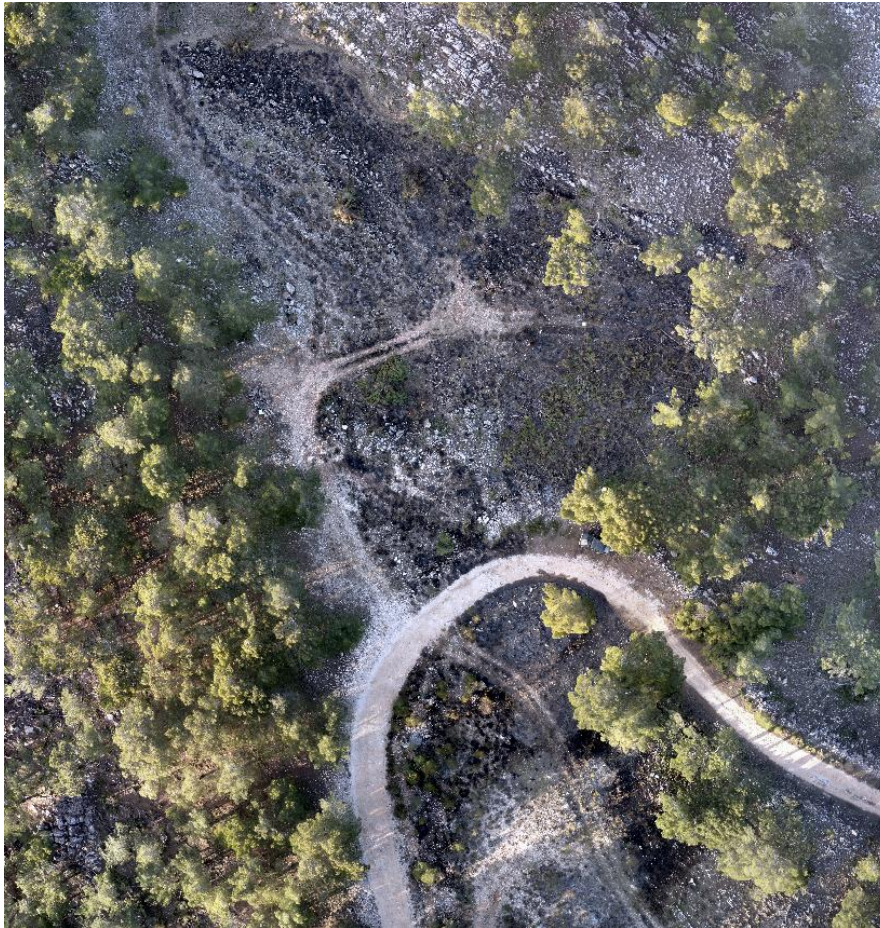
Figure 5 - A post-PB highly detailed mosaic