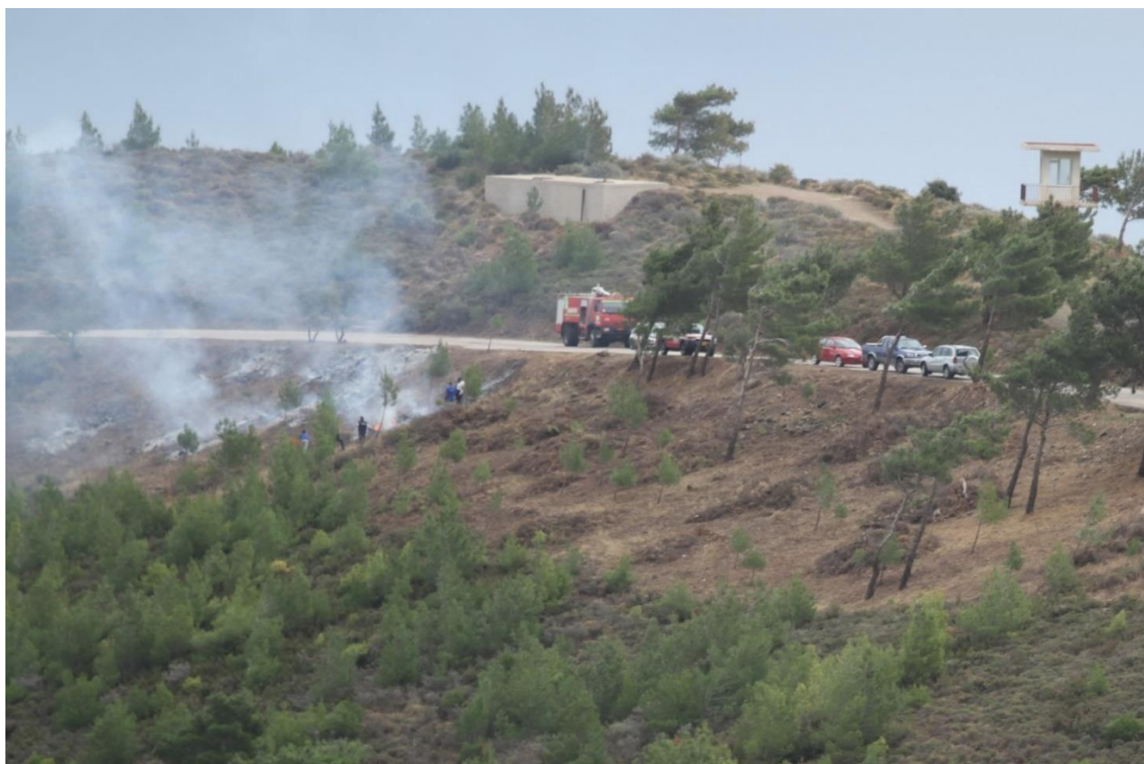
Figure 1 Omikron volunteers constructing a fuel break in Chios Island, in 2012

The Chios Voluntary Action Team – Omikron was created in 1999. It is based on Chios Island; operates across the entire island and potentially in the Prefecture of Northern Aegean, and is quite active in wildfire suppression, in prevention [construction of fuel breaks (Athanasidou 2016, 2018, Figure 1), population awareness raising] as well as in restoration and reforestation activities (such as planting seedlings for reestablishing forest vegetation in desertified areas).